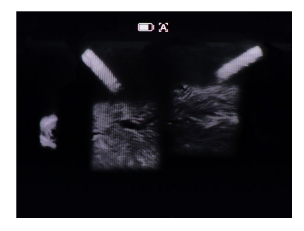
Old Firmware Version