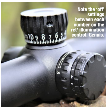
Note the 'off' settings between each number on the ret' illumination control. Genius.

"one of the most impressive pieces of shooting hardware I've ever used"