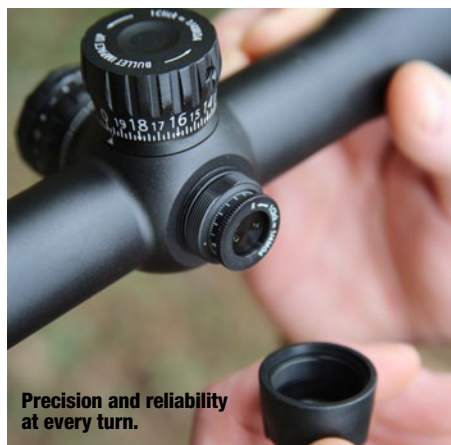
Precision and reliability at every turn.