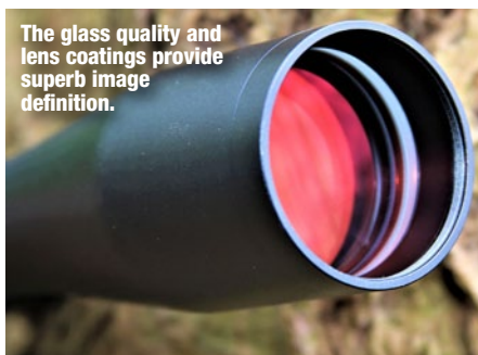
The glass quality and lens coatings provide superb image definition.