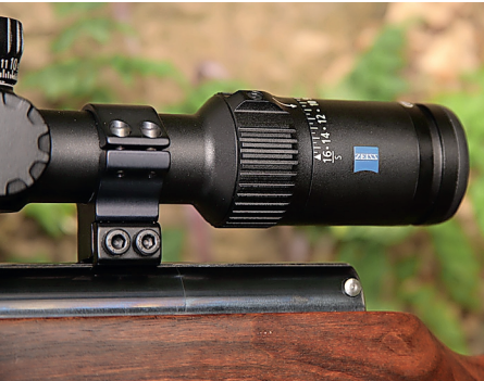
Smoothness personified, from rifle and scope.

real-world benefits of superior performance.