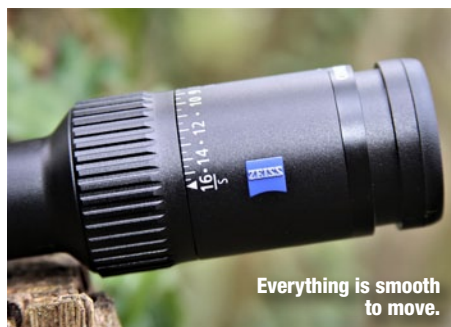
Everything is smooth to move.