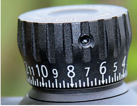
Precision and reliability at every turn.