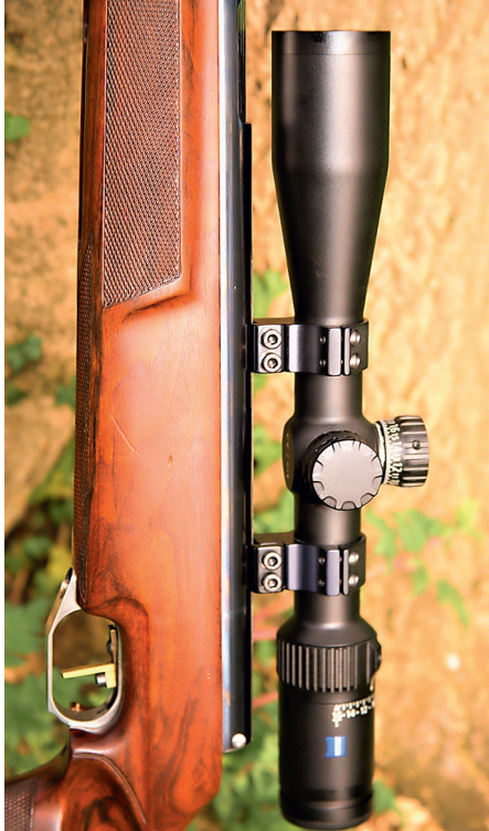
I went with single-piece SportsMatch mounts, and nothing shifted. That scope looks the part, too.